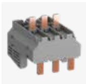
Connection kit for PSR60...72