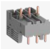
Connection kit for PSR37...45