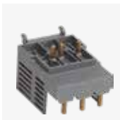
Connection kit for PSR25...30