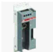
Fieldbus plug adapter